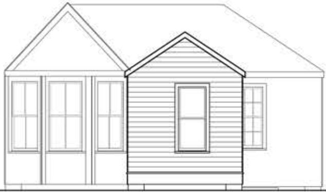
3 West (Rear) Elevation A-1 1/8" = 1'0"